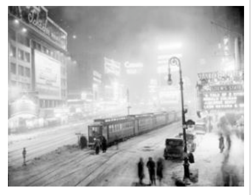
From 1939 Times Square to the Towers in the 90's, the Daily News has the legendary photos of NYC.